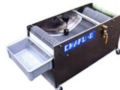
Heavy Solids Removal System