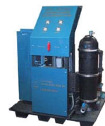
WASH WATER RECYCLE SYSTEMS