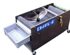
HEAVY SOLIDS REMOVAL SYSTEMS