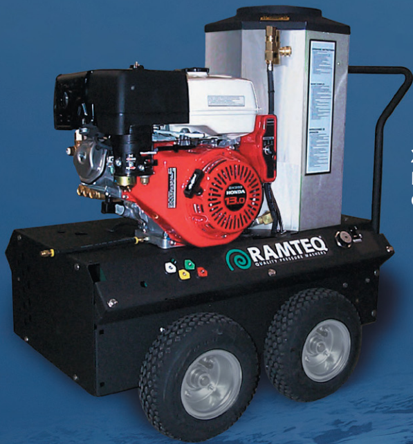
XVG1300 DIRECT DRIVE GASOLINE

The XV Gasoline & Electric series are the most innovative pressure washers in the industry. With features such as interchangeable wheel configurations, these products are ideal for industrial and commercial cleaning applications. RAMTEQ's top quality, durable construction provides years of reliability. Designed with the user in mind, RAMTEQ's modular technology supports low operational costs through easy, efficient and effective service and upgrade paths. RAMTEQ products designed and built for performance, dependability and low total cost of ownership.