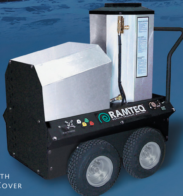
XVE500 BELT DRIVE ELECTRIC WITH OPTIONAL COVER