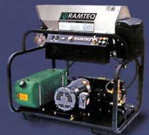
CH1600 BELT DRIVE WITH OPTIONAL CLOSEOUT PANEL & OPTIONAL PRESSURE GAUGE