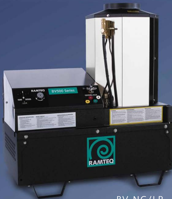
BV NG/LP 500, 750