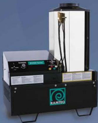
BV NG/LP 1000