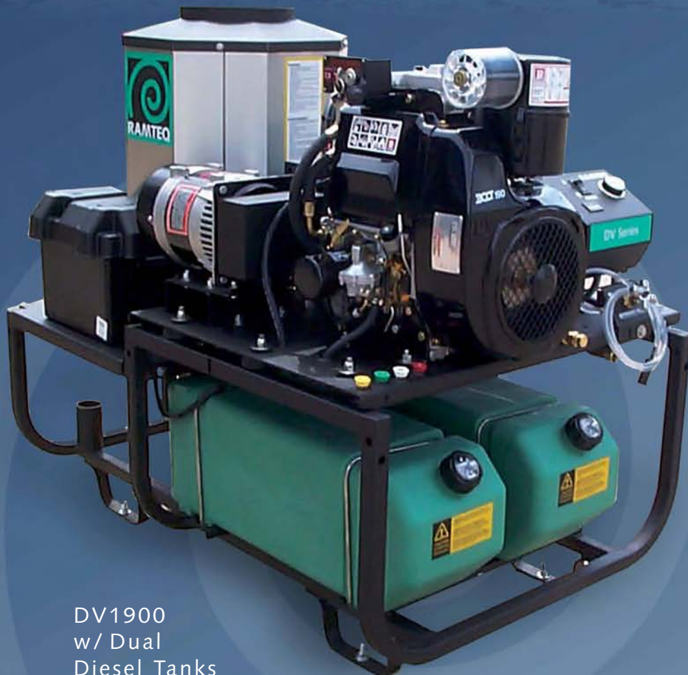
DV1900 w/ Dual Diesel Tanks